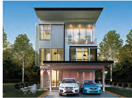
BUNGALOW TYPE A