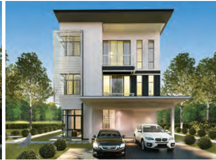
BUNGALOW TYPE B2