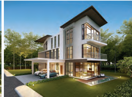
BUNGALOW TYPE C